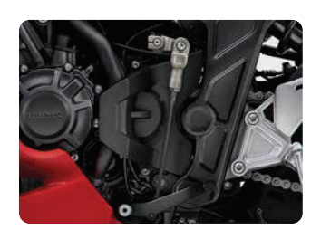
QUICK SHIFTER KIT 08U72-MKN-D50 By measuring the intensity of the shifting input, the quick shifter enables the rider to change gear without the need to operate the clutch lever or shut the throttle. The system aids upshifting, maximizing the riding experience. Not compatible with E-Clutch versions.