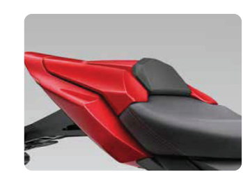
REAR SEAT COWL 08F71-MKY-E20ZA / 08F71-MKY-E20ZB

Elevate your motorcycle's racing aesthetics with this Rear Seat Cowl, complete with a comfort pad. For a truly exclusive appearance, consider the optional Aluminum Seat Cowl Plate 08F76-MKN-D50 (available separately). Replaces the pillion seat.