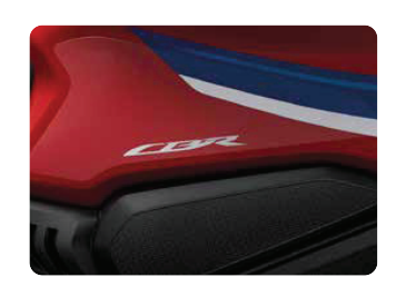
TANK SIDE STICKER 08F72-MKY-E00ZA These transparent tank side stickers, which feature the CBR logo, add protection to the fuel tank againts scratches and rubbing, while their flexible sheet material makes them easy to install on the tank surface.