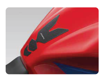
TANK PAD 08P82-MKR-D10 This rubber-made pad is exclusively designed to fit the tank shape and to protect it from scratches.