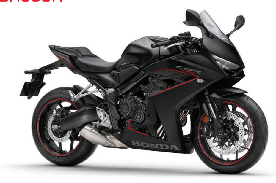
The CBR650R in action.